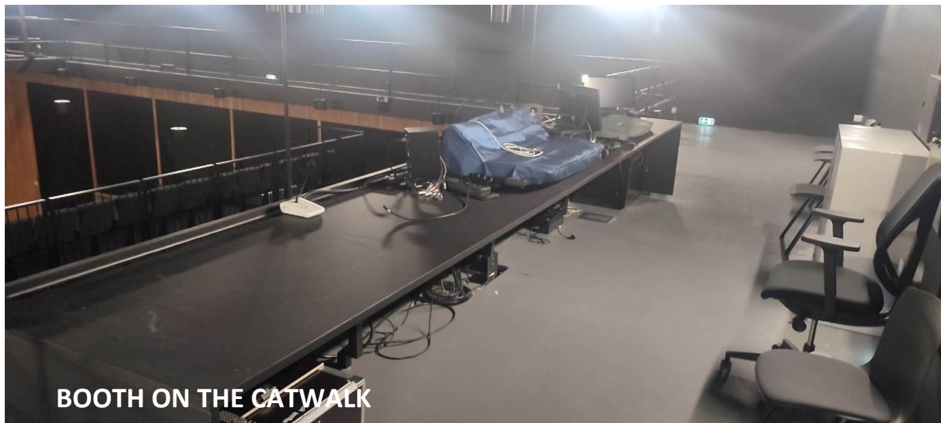
BOOTH ON THE CATWALK