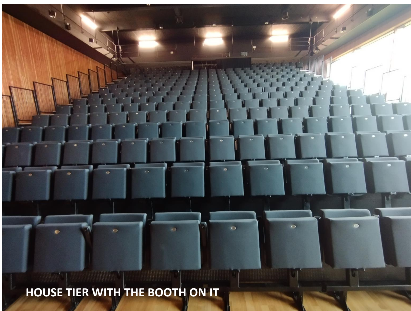
HOUSE TIER WITH THE BOOTH ON IT